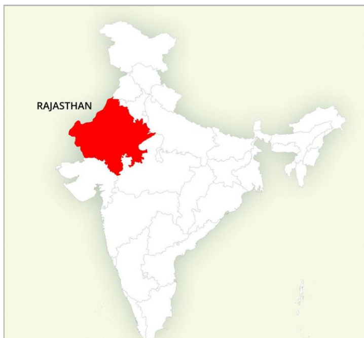
Figure 1: Rajasthan's Location

Rajasthan, in north-west India, is the largest Indian state by area, covering 342,239 square kilometres, or 10.4% of the country's total geographical area. Rajasthan's population is estimated to be 81 million, according to June 2020 Aadhaar data from the Unique Identification Authority of India.