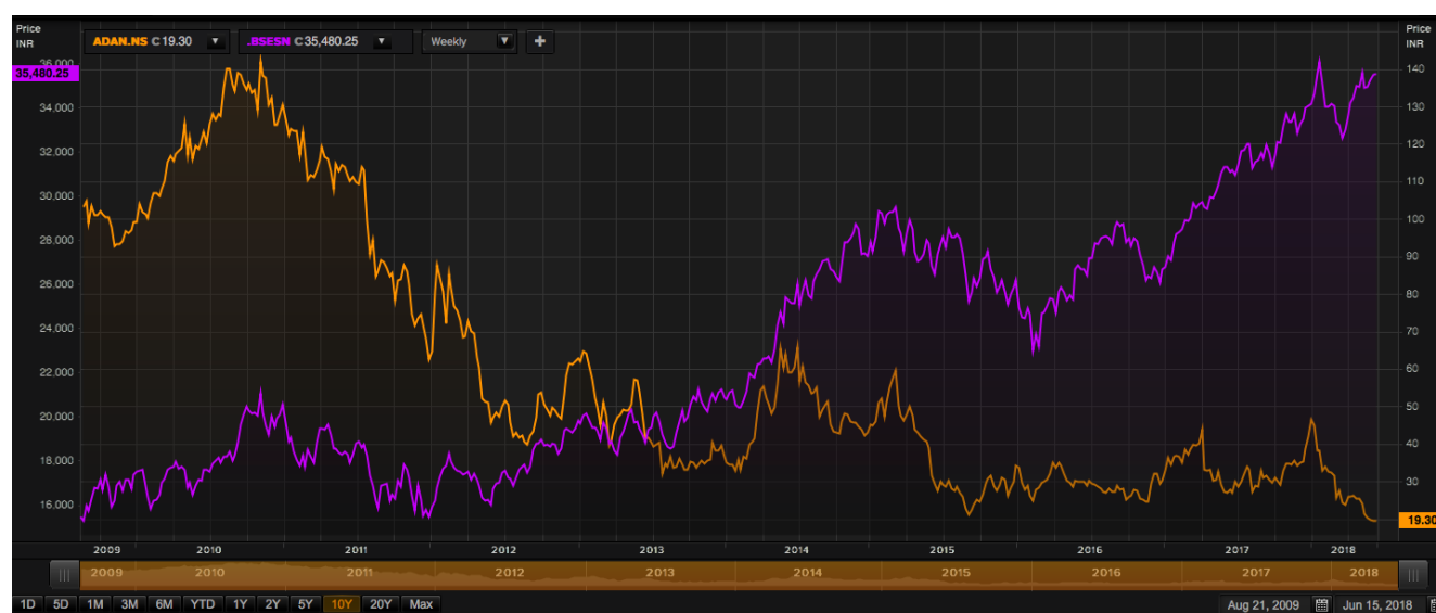
Figure 4.5: Adani Power Share Performance (Orange) vs. S&P BSE Index (Purple) Over 10 Years

Adani's proposed expansion at Udupi runs counter to India's long-term plan to reduce thermal coal imports and lower electricity costs, and there is plenty of evidence across India to illustrate the severe financial difficulties associated with such projects. NTPC, for example, in July 2018 announced it has shelved its 4 GW greenfield coal-fired Pudimadaka Ultra Mega Power Project, a facility planned for the coast of Andhra Pradesh that would have relied on expensive imported coal. 31