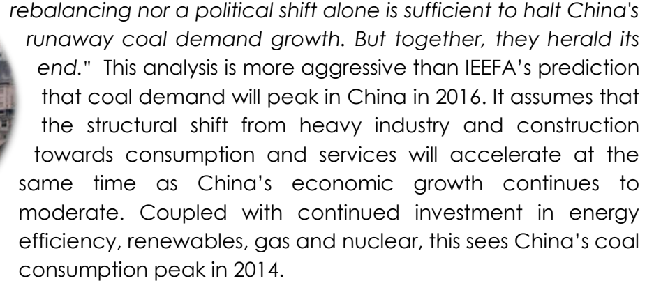
Coal plant in China.

peaks by 2014, then declines through 2020. Neither an economic