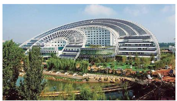
A building fully-equipped with solar power facilities in Dezhou, China.

In a separate report, Goldman Sachs forecast A that China's thermal coal imports are expected to fall from 150 million tonnes (Mt) in 2013 to 146Mt in 2014, dwindling to 75Mt by 2018.