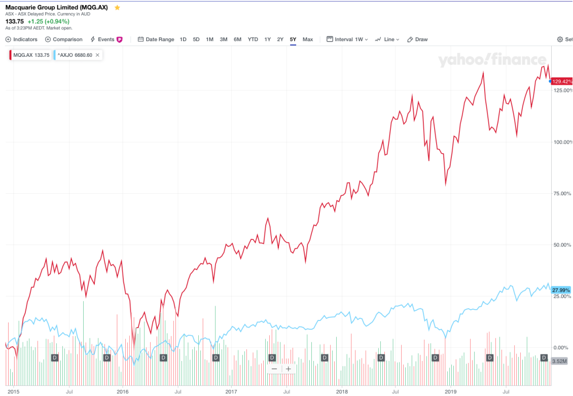
Figure 6: Macquarie Group (Five Years to 2019)