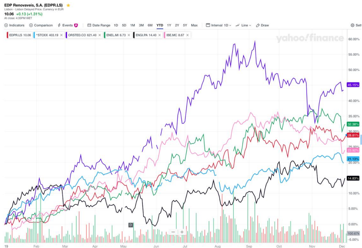
Figure 3: Share Price Performance of European Renewable Energy Leaders (Year to Date 2019)

In terms of the share price performance of European renewable energy leaders for the previous five years to 2019 (see figure 4), EDPR (+90%, red), Orsted (+217%, purple), ENEL (+86%, green) and Iberdrola (+90%, pink) have all massively outperformed the European market (+22%, the STOXX, blue).