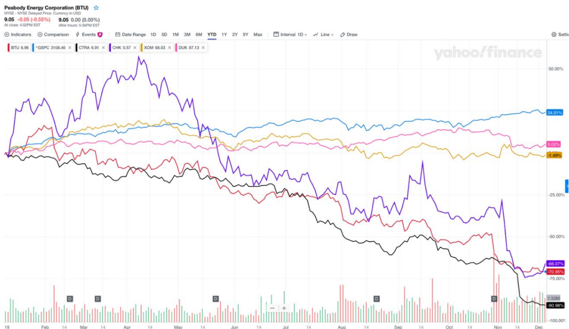
Figure 7: U.S. Fossil Fuel Leaders (Year to Date 2019 Share Price Performance)

The largest thermal power generator in the U.S. is Duke Energy (+5%, pink). While its shares are up in absolute terms, it has again materially underperformed the S&P 500 index (+24%, blue).