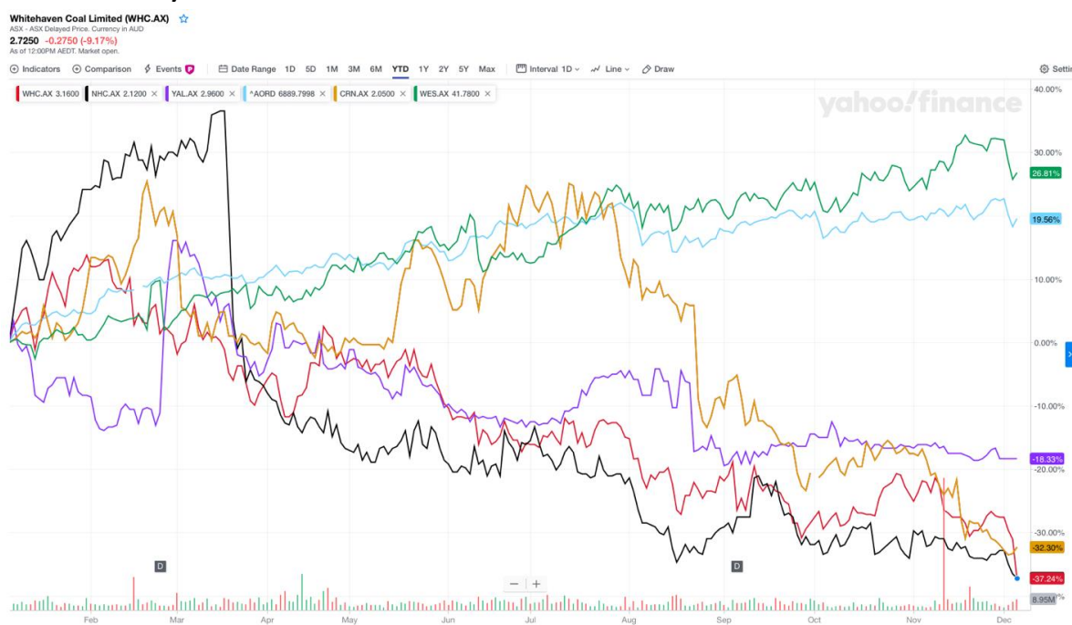
Figure 8: Australian Coal Mining Majors (Year to Date 2019 Share Price Performance)

IEEFA also included Wesfarmers (+27%, green) given it exited its last coal mine ownership in 2018 and pivoted into lithium mining, seeing the global growth opportunities in lithium ion batteries and electric vehicles as the decarbonisation trend sees a technology convergence in the transport and stationary energy sectors.