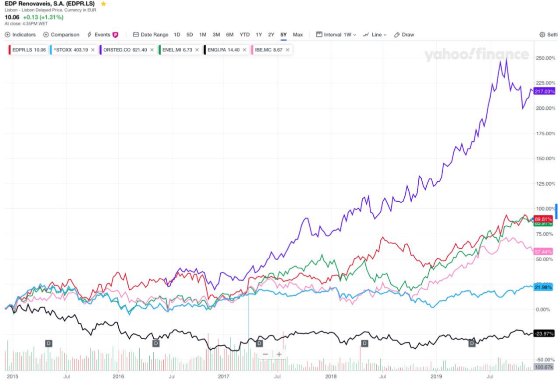
Figure 4: Share Price Performance of European Renewable Energy Leaders, Five Years to 2019