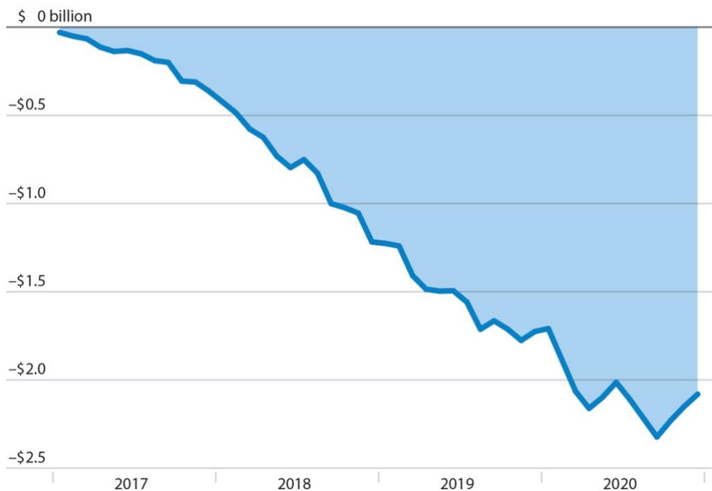
Figure 2: Cumulative Free Cash Flow From ExxonMobil Permian Horizontal Wells Brought Into Production 2017-2020

Source: IEEFA estimates, based on IHS Markit Dynamic North America database. See appendix for explanation of free cash flow estimation methods.