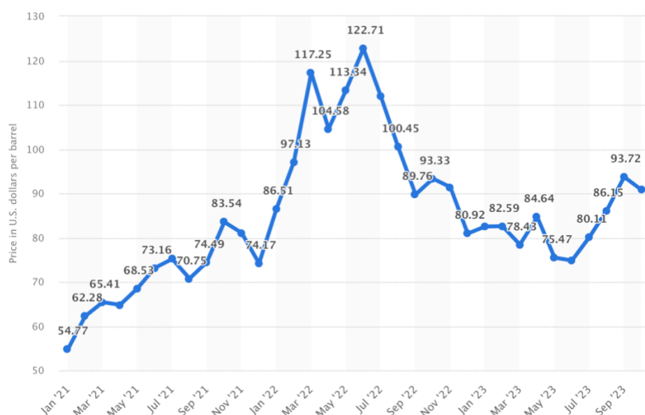
Figure 3: Oil Price From January 2021 to September 2023