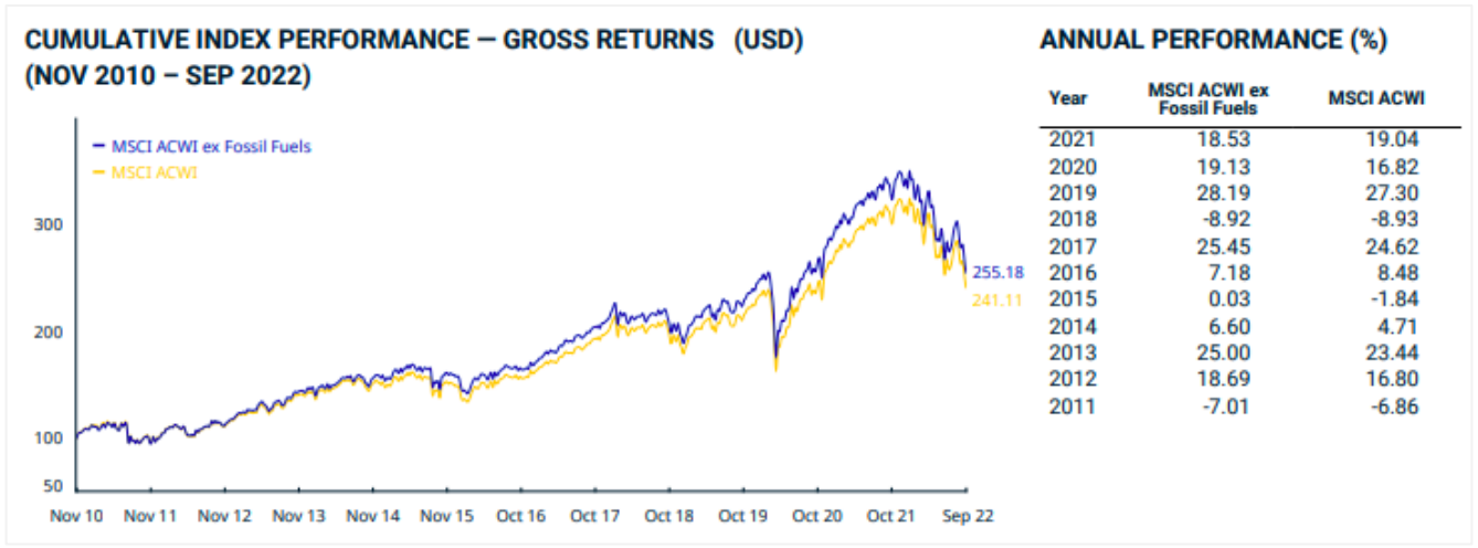
Figure 2: Cumulative Returns of MSCI World Index vs. MSCI World Index ex Fossil Fuels, 11/2010 - 9/2022