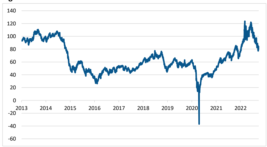
Figure 3: Oil Prices

The low prices tracked lower through 2019. The low-price bottom was reached in 2020 with the onset of the COVID-19 pandemic and the shutdown of the market.<sup>14</sup> Prices dropped into the $20s and ran negative at some points.<sup>15</sup>