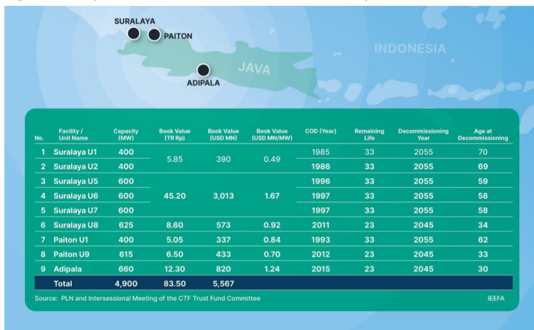
Figure 2: Proposed PLN Coal Plans for Retirement by 2030