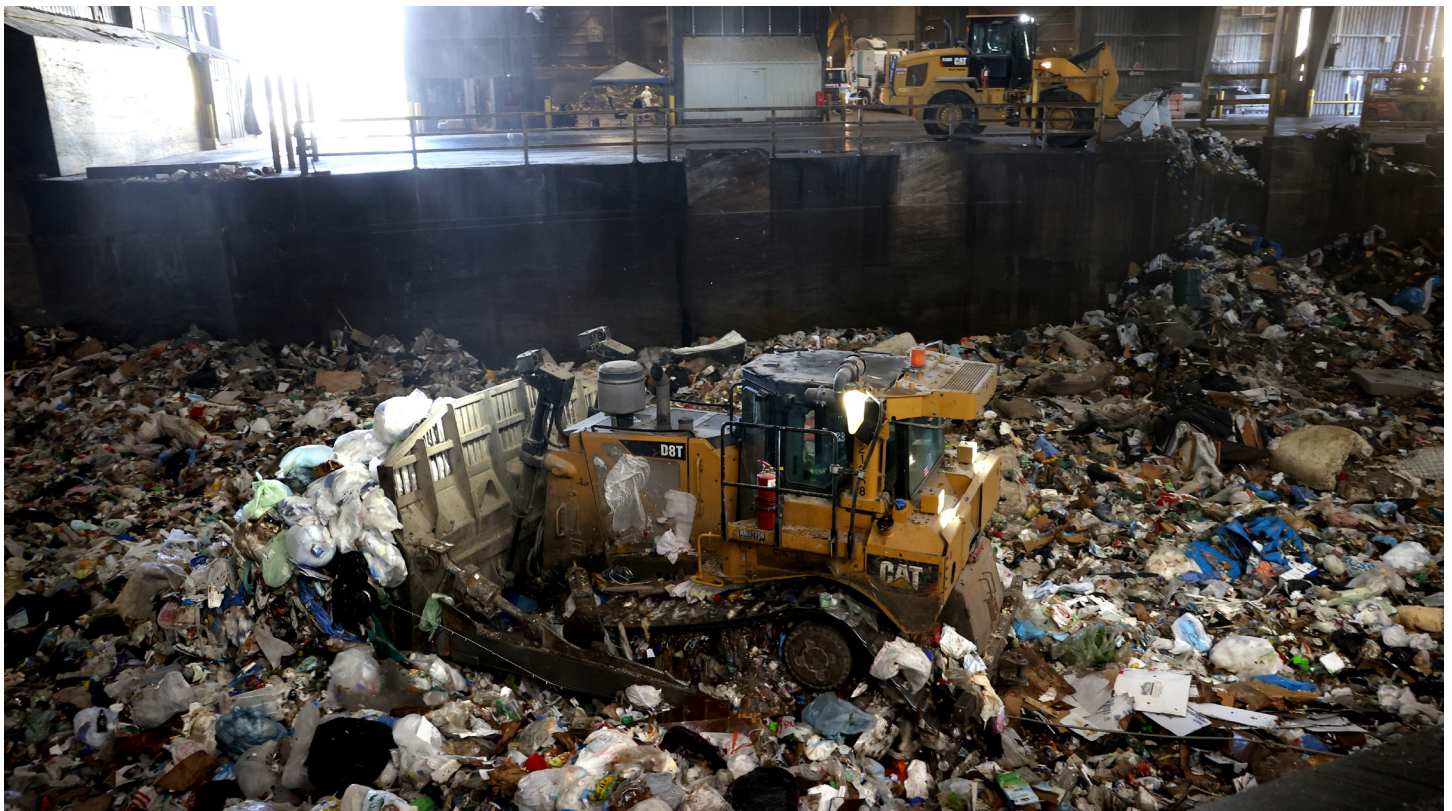
A bulldozer pushes a pile of waste, including plastic trash.