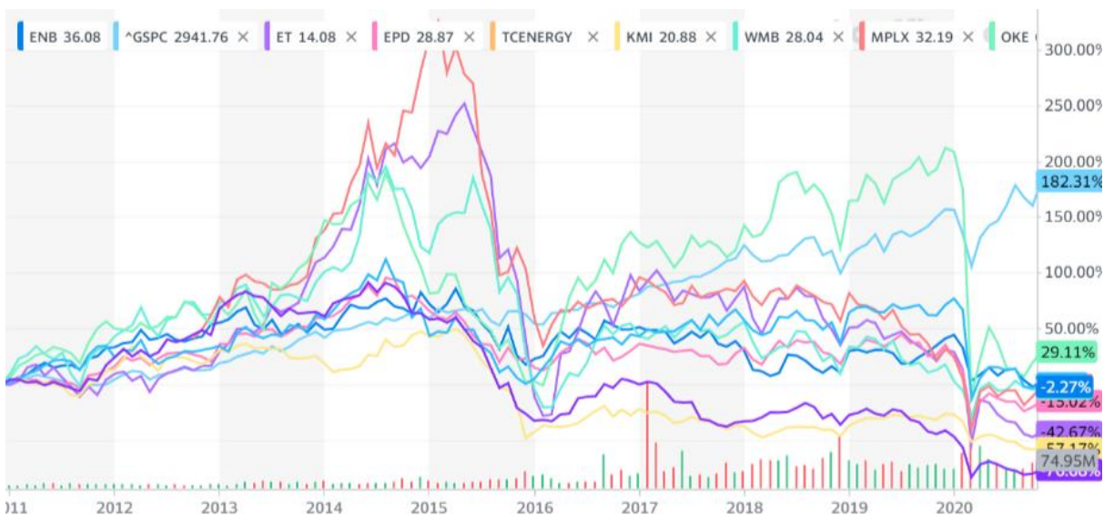
Figure 1: Performance of Selected Energy Sector Transport and Pipeline Companies Compared to S&P 500 Index, October 2010 to November 30, 2020 26

Legend: ENB: Enbridge; GSPC = S&P 500 Index; ET = Energy Transfer; EPD = Enterprise Product Partners; TCENERGY = TC Energy; KMI = Kinder Morgan Inc.; WMB = Williams Corporation; MPLX = MPLX; OKE = ONEOK