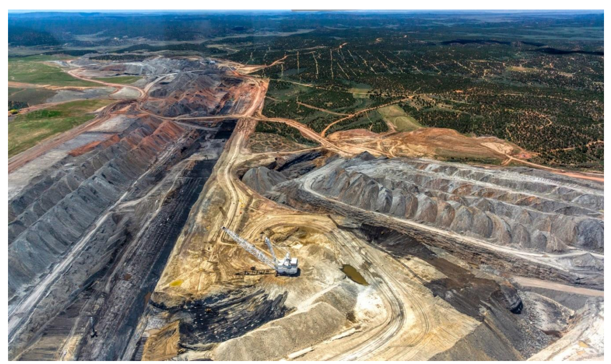
An aerial photograph taken in late May shows an active Kayenta Mine area, part of a roughly 3-mile-long cut that is one segment of a bigger Peabody Energy operation on Navajo and Hopi lands dating from the early 1970s.

The photograph below—part of a series that appear in this report—suggests the scale of cleanup work that remains at the complex.