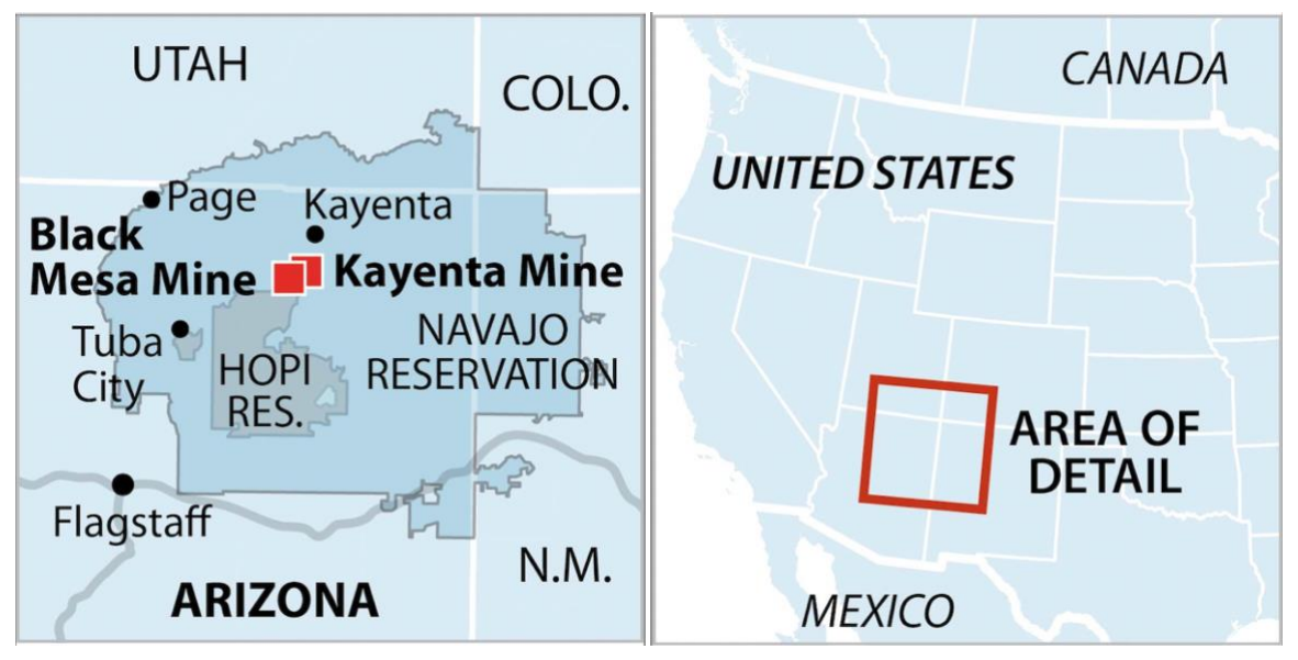
Figure 1: Map of Affected Areas on Navajo and Hopi Reservation Land

Peabody used hundreds of thousands of gallons of water daily from one of the only potable sources of water in the Black Mesa region, which is located in the Four Corners desert region of Arizona and is on reservation land for both the Navajo and Hopi tribes (See Figure 1). Peabody's mines operated for almost five decades on tribal lands, depleting scarce water sources, yet OSMRE did not include water use or aquifer depletion in its considerations of environmental damages caused by Peabody.<sup>1</sup> The oversight demonstrates a flaw in OSMRE's criteria for environmental reclamation and a failure on the part of the DOI to hold Peabody accountable and uphold its trust responsibilities to the Navajo and Hopi tribes in Black Mesa.