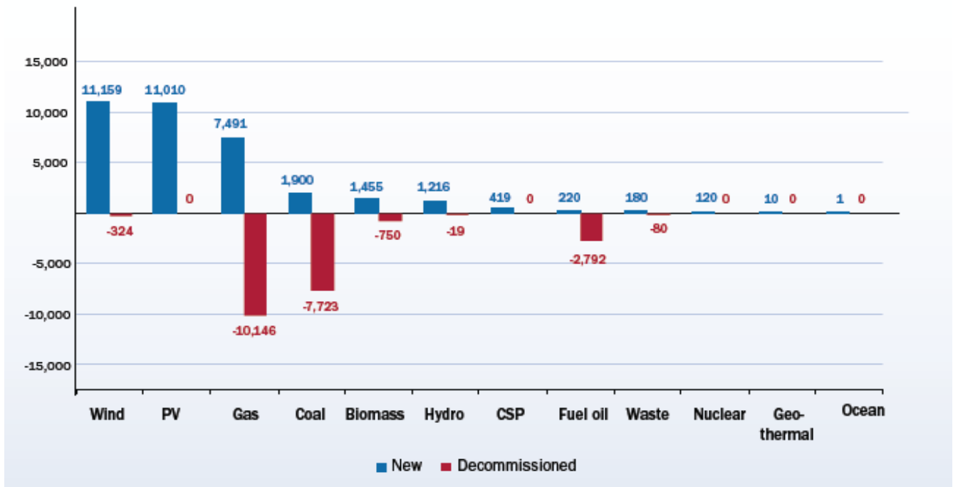
Source: European Wind Energy Association, February 2014, “Wind in Power”

US coal fired capacity continues to fall: The Brattle Group in Nov’2013 published its latest review of the US Electricity sector, concluding: “In our October 2012 study, we found that 59 to 77 GW of coal plant capacity are likely to retire over the next 5 years, which is approximately 25 GW more than we previously estimated in 2010 despite somewhat more lenient environmental regulations in 2012.” xi